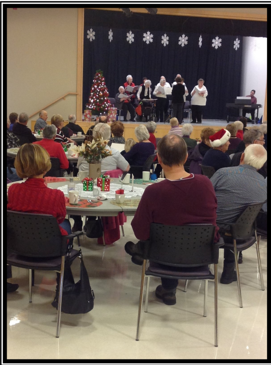
Enjoying the entertainment after lunch.

Thanks to all for your support of the 55+ Club and the activities we have throughout the year. Merry Christmas to all!